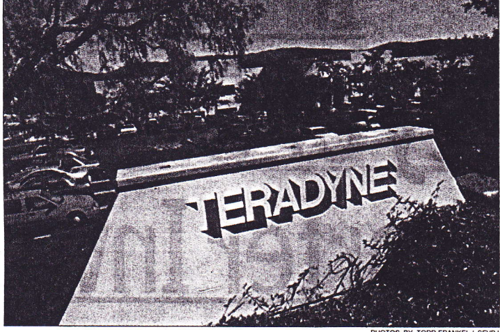
Worth the trouble: Companies like Teradyne stick by Agoura Hills.

Agoura Hills is home to about 21,400 res-