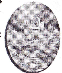
"Summerhill Garden" 16"x12" oval