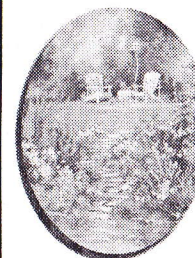
"Birdsong Garden" 16"x12" oval

Enter Our Garden Contest For A Chance To Win These Paintings!